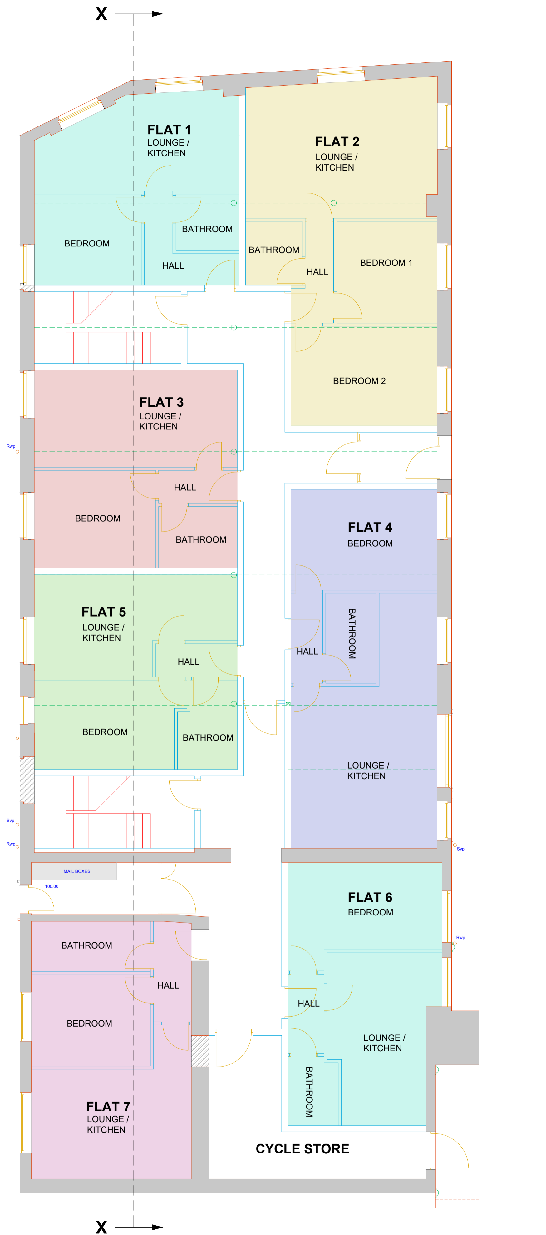
PROPOSED GROUND FLOOR PLAN

This drawing is provided as a document to gain either Planning Permission or Building Regulation approval purposes only. It is not a guarantee that Planning Permission will be granted. This drawing and all contents are the copyright of James Campbell Associates Ltd. No copies to be made from the drawing & details without written authority from James Campbell Associates Ltd. The contract for the works is between the client and his / her contractor. Contractor to visit site, study the details provided within the drawing and be familiar with both the work to be carried out in accordance with the details provided. Any stated dimension must be checked prior to any form of construction. All works and materials to comply with all relevant British Standards and carry a genuine BBA certificate. The materials specified within this drawing are a guide for the contractor as they are recognised materials with genuine BBA certificates etc. Any contractor who decides to use any different materials than that noted on the drawing must inform James Campbell Associates Ltd. Any discrepancies discovered or items found that were not visible at the time of the initial survey should be reported to James Campbell Associates Ltd for consultation with our client.